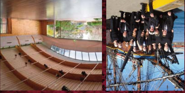
On tour in Portland, 2012

Rehearsals take place on most Monday evenings (except Public Holidays) from 7.45pm to 10pm in the magnificent 'Arbour' of the Box Hill Community Arts Centre. There is no need to contact the choir prior to attending, although the President would be very pleased to speak to you should you have any questions regarding the choir before attending.