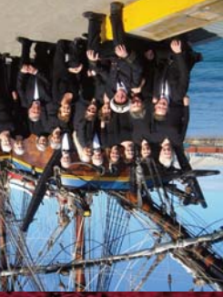
On tour in Portland, 2012