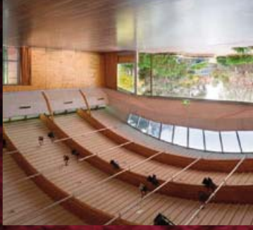
The Box Hill Community Arts Centre